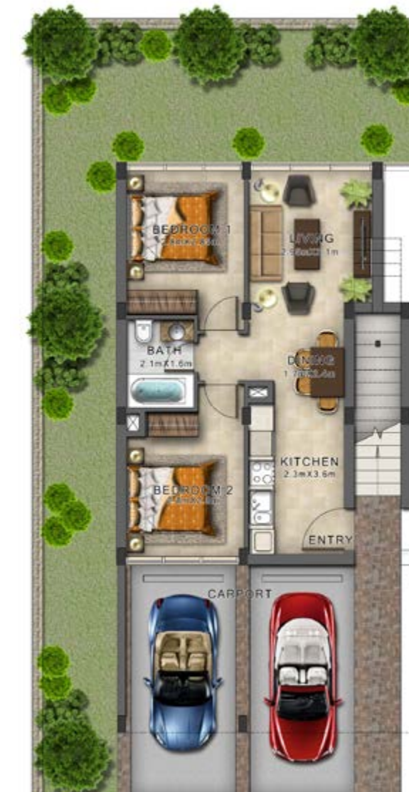
TH2G-EM / Ground