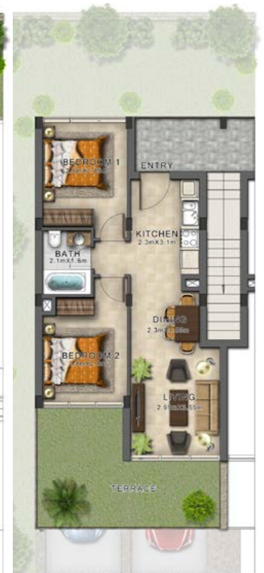
TH2F-EM / First Floor

Disclaimer: Unless stated above, all accessories and interior finishes such as wallpaper, chandeliers, furniture, electronics, white goods, curtains, hard and soft landscaping, pavements, features, swimming pool(s) and other elements displayed in the brochure, or within the show apartment / villa or between the plot boundary and the unit, are not part of the standard unit and exhibited for illustrative purposes only. Areas shown are based on plans at the time of printing; actual dimensions could vary up to final 'as built' status and are not intended to form part of any contract or warranty.