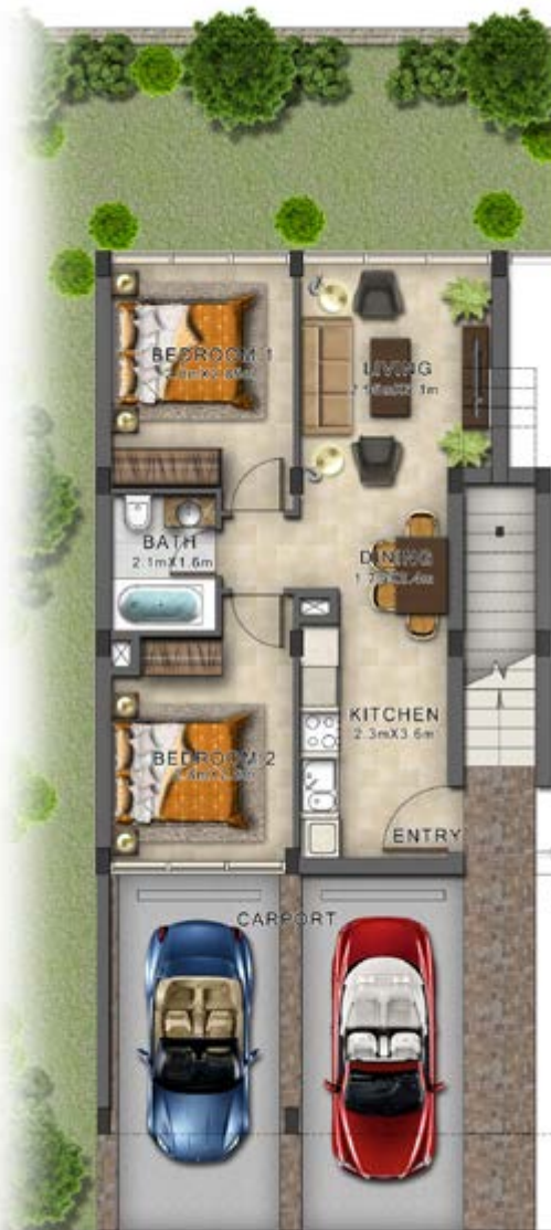
TH2G-EE / Ground