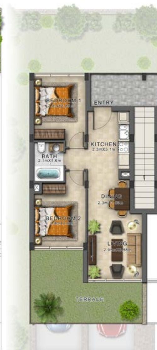
TH2F-EE / First Floor